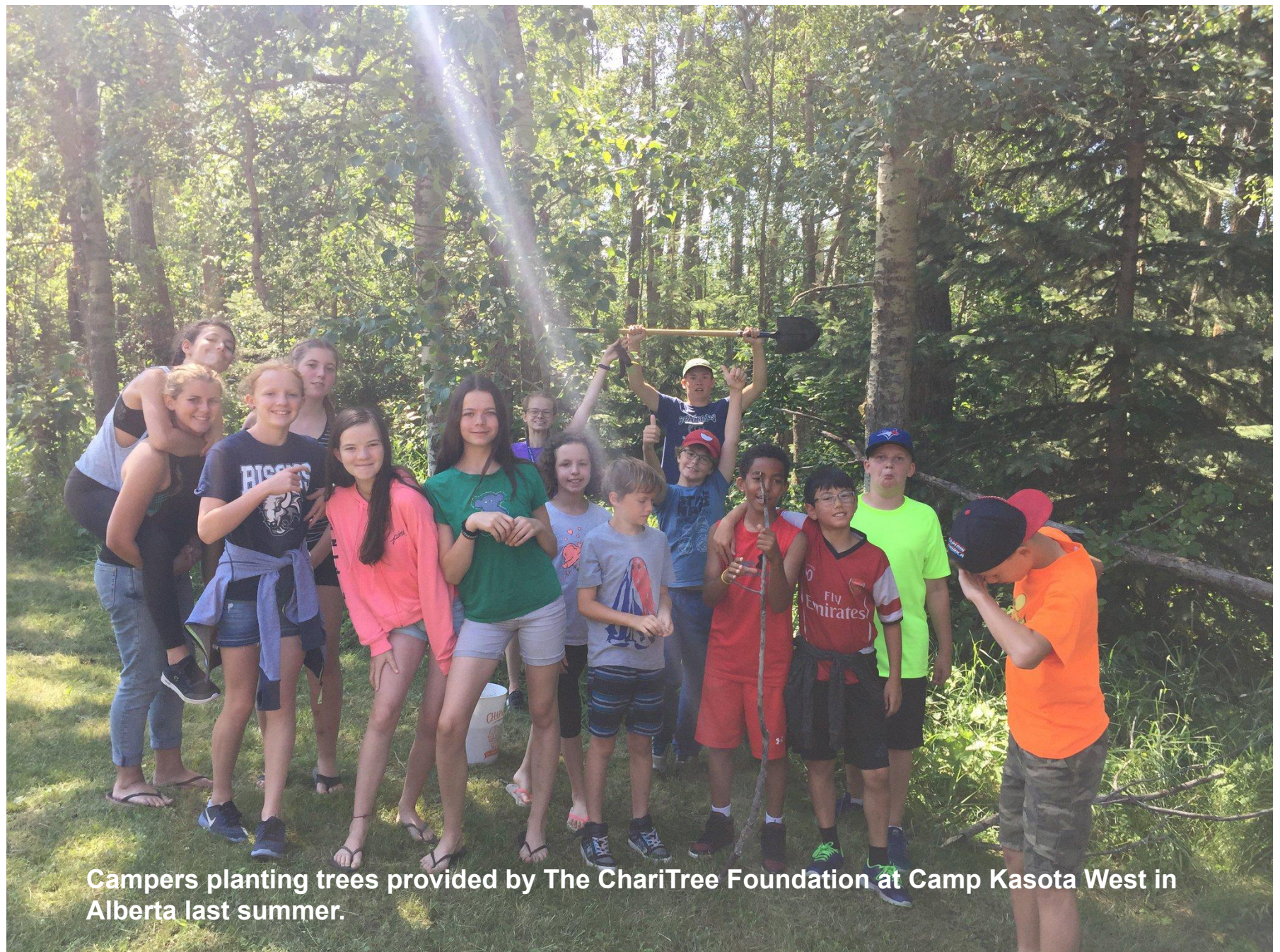
Campers planting trees provided by The ChariTree Foundation at Camp Kasota West in Alberta last summer.