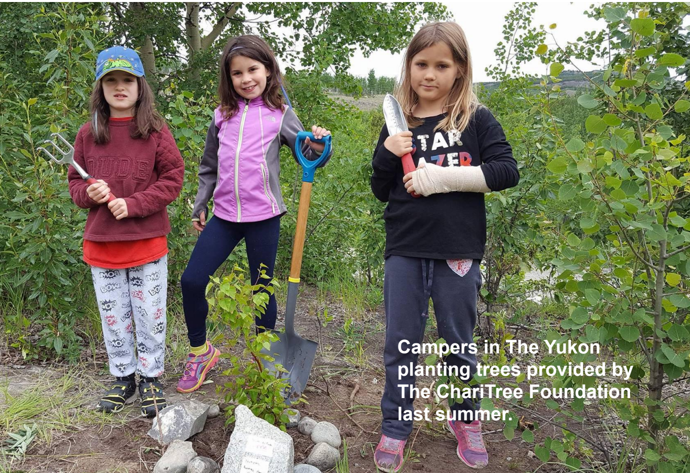
Campers in The Yukon planting trees provided by The ChariTree Foundation last summer.